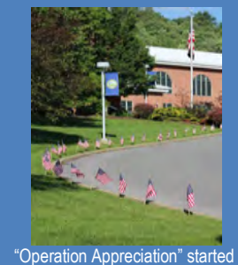
n May and hundreds of Ameri lags were displayed to honor emember veterans in the ommunity during July 4th