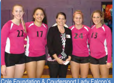
eyball teamed up to support October Breas ancer Awareness Month.